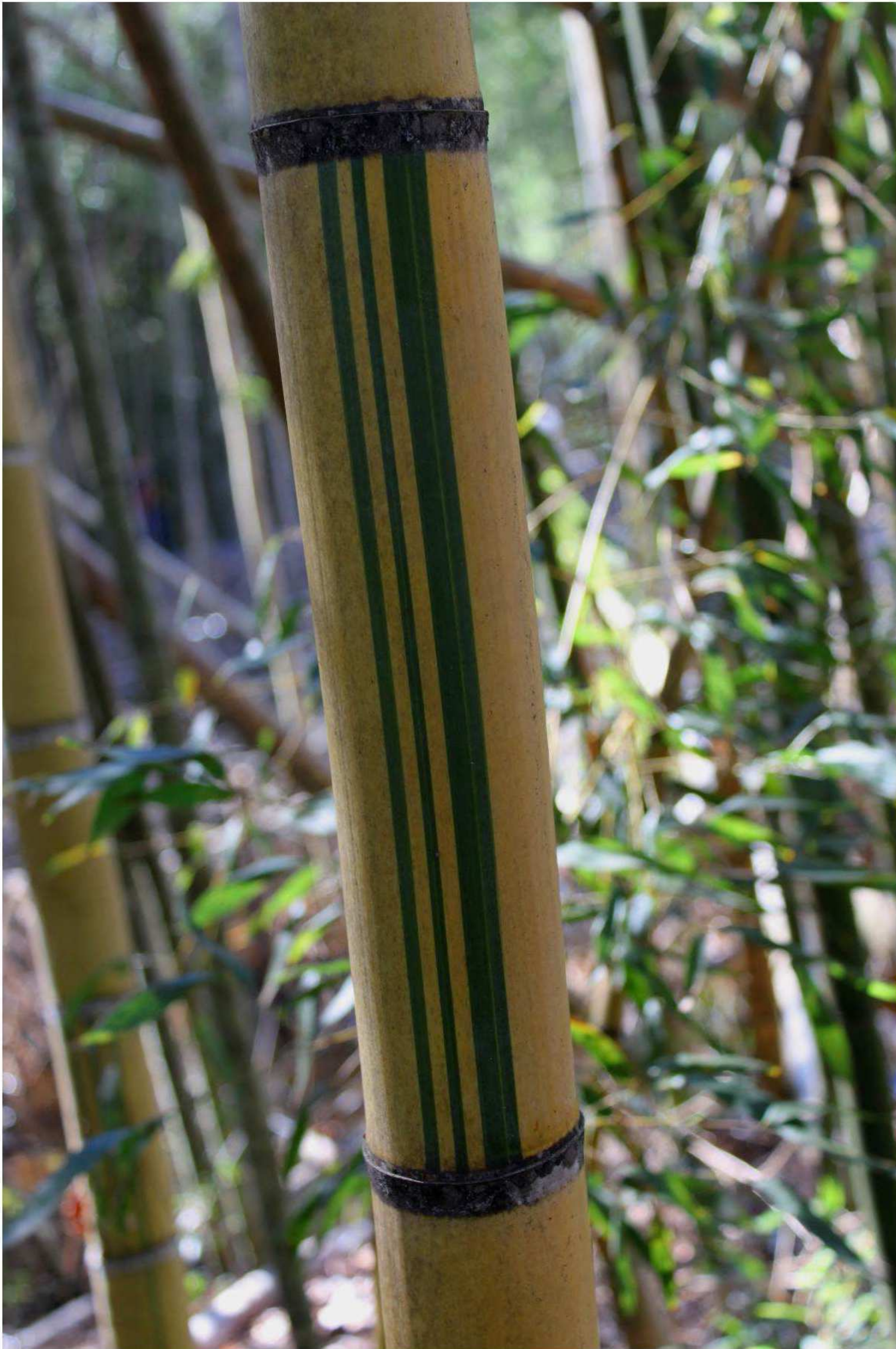
Figure 10. Phyllostachys sulphurea var. viridis (Poaceae).